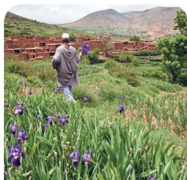
IRIS ETHICALLY SOURCED FROM THE ATLAS MOUNTAINS, MOROCCO

At Weleda we do not only make beautiful natural care products, we also work with and for the good of the planet, the plants and the people who grow and rely on them. Lavender, iris and ylang ylang – raw materials contained in our Weleda Shower Bars – are the result of our long-term partnerships and community commitments. At Weleda, we focus on establishing long-term growing projects, fair remuneration for all, the advancement of women and supporting our workers to create a better balance between their family and their career.