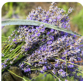
LAVENDER ETHICALLY SOURCED FROM BESSARABIA, MOLDOVA