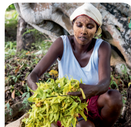
YLANG YLANG ETHICALLY SOURCED FROM THE ISLAND OF NOSY BE, MADAGASCAR