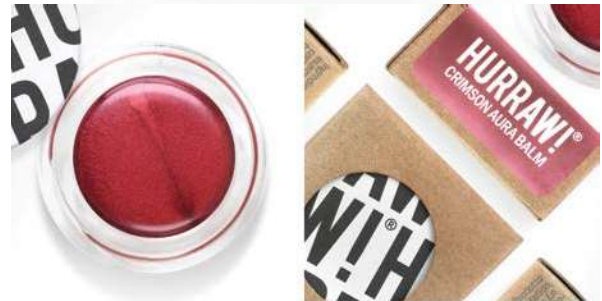
Crimson Aura Balm